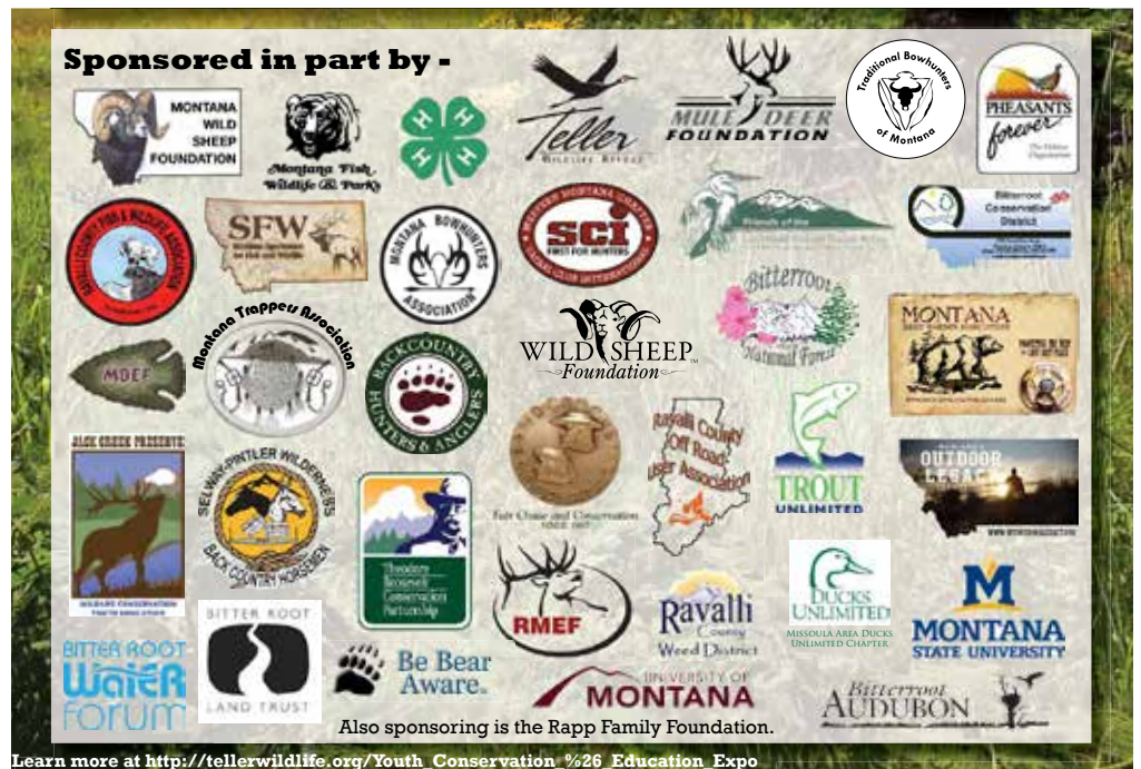
Learn more at http://tellerwildlife.org/Youth_Conservation_%26_Education_Expo